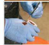
Sealer makes life easy. Because the glaze is sealed, excess filler can be wiped away easily, and glaze can be dabbed on to match the rest of the finish.