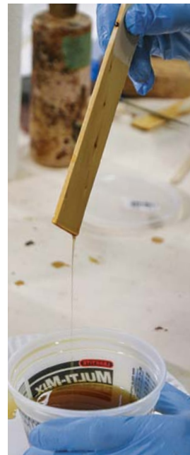
Gauge the viscosity. Let the stirred varnish run off the end of a mixing stick while counting (one-one thousand, two-one thousand, etc.). If the stream changes to drips at around the four count, you're good to go. If it takes much longer, thin the finish and test again.