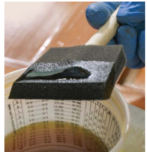
Charge the foam. After wetting the foam brush with mineral spirits, dunk it several times into the varnish, letting the finish soak into the foam between each dunk. This loads the foam with finish for a better application.

For applying varnish, I use an artist's brush for the detail work and switch to a disposable foam brush for the panels, rails, and stiles. For some, the idea of using a cheap foam brush flies in the face of the well-established belief that if you want a good brush, you have to spend good money. That's not always true. If it's a good foam brush (one where the tang extends close to the tip of the foam for full support), you can lay an even, bubble-free coat of finish that rivals any produced by an expensive brush, and you can save yourself the cleaning and waste solvent involved in the latter. If you use satin or semigloss varnish, stir it every few minutes while working so that the flatteners