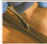
Epoxy for the holes. A two-part epoxy filler mixed with dry pigment creates a tinted filler that's easy to pack into nail holes or blemishes.