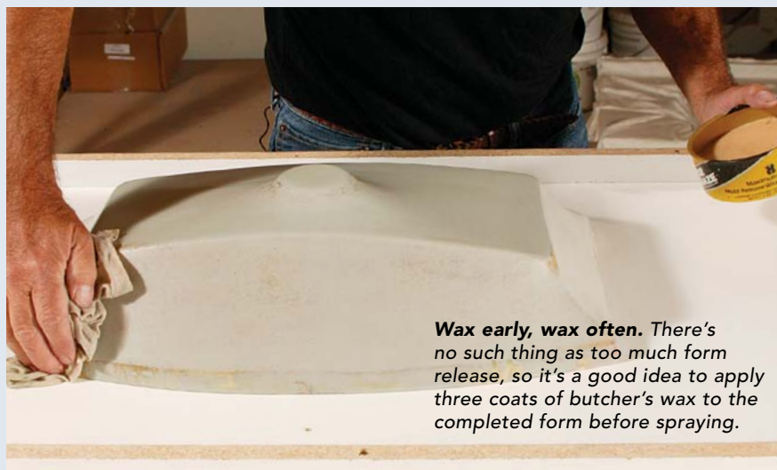
Wax early, wax often. There's no such thing as too much form release, so it's a good idea to apply three coats of butcher's wax to the completed form before spraying.