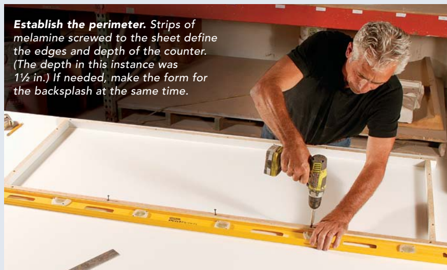
Establish the perimeter. Strips of melamine screwed to the sheet define the edges and depth of the counter. (The depth in this instance was 1\frac{1}{2} in.) If needed, make the form for the backsplash at the same time.

The counter form needs to be flat and smooth. The easiest way to make a form is to lay out the shape on a full sheet of \frac{3}{4} -in. melamine.