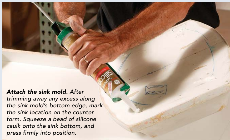
Attach the sink mold. After trimming away any excess along the sink mold's bottom edge, mark the sink location on the counter form. Squeeze a bead of silicone caulk onto the sink bottom, and press firmly into position.