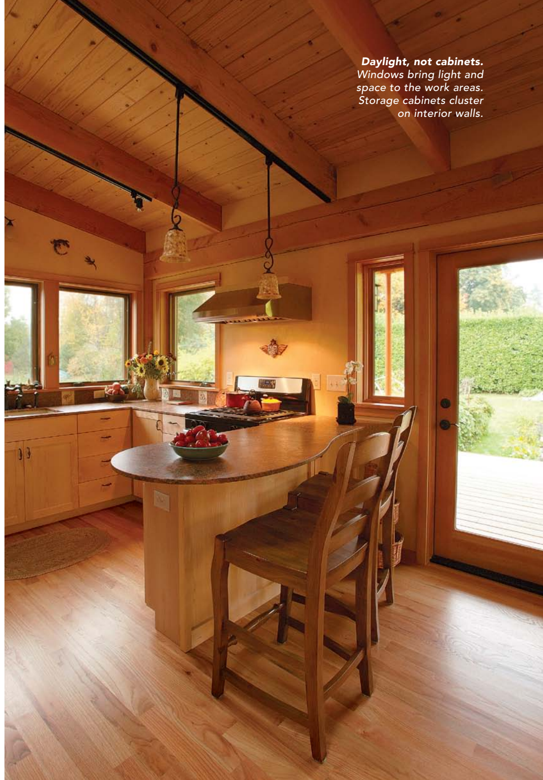
Daylight, not cabinets. Windows bring light and space to the work areas. Storage cabinets cluster on interior walls.

The Pacific Northwest is known for its long, rainy winters, prompting a "shed the water and bring in the light" strategy. Summers can be hot, however, so solar protection is necessary. Generous overhangs on the house's low-sloped shed roofs address all these issues. The south-sloping roof extends the full width of the house and shelters the great-room windows from winter storms and summer heat. It also points two solar arrays toward the sun and allows for north-facing clerestories to illuminate the guest room and loft. The