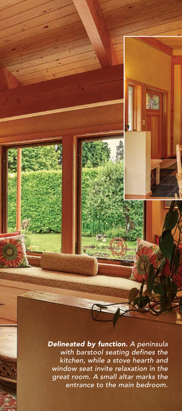
Delineated by function. A peninsula with barstool seating defines the kitchen, while a stove hearth and window seat invite relaxation in the great room. A small altar marks the entrance to the main bedroom.