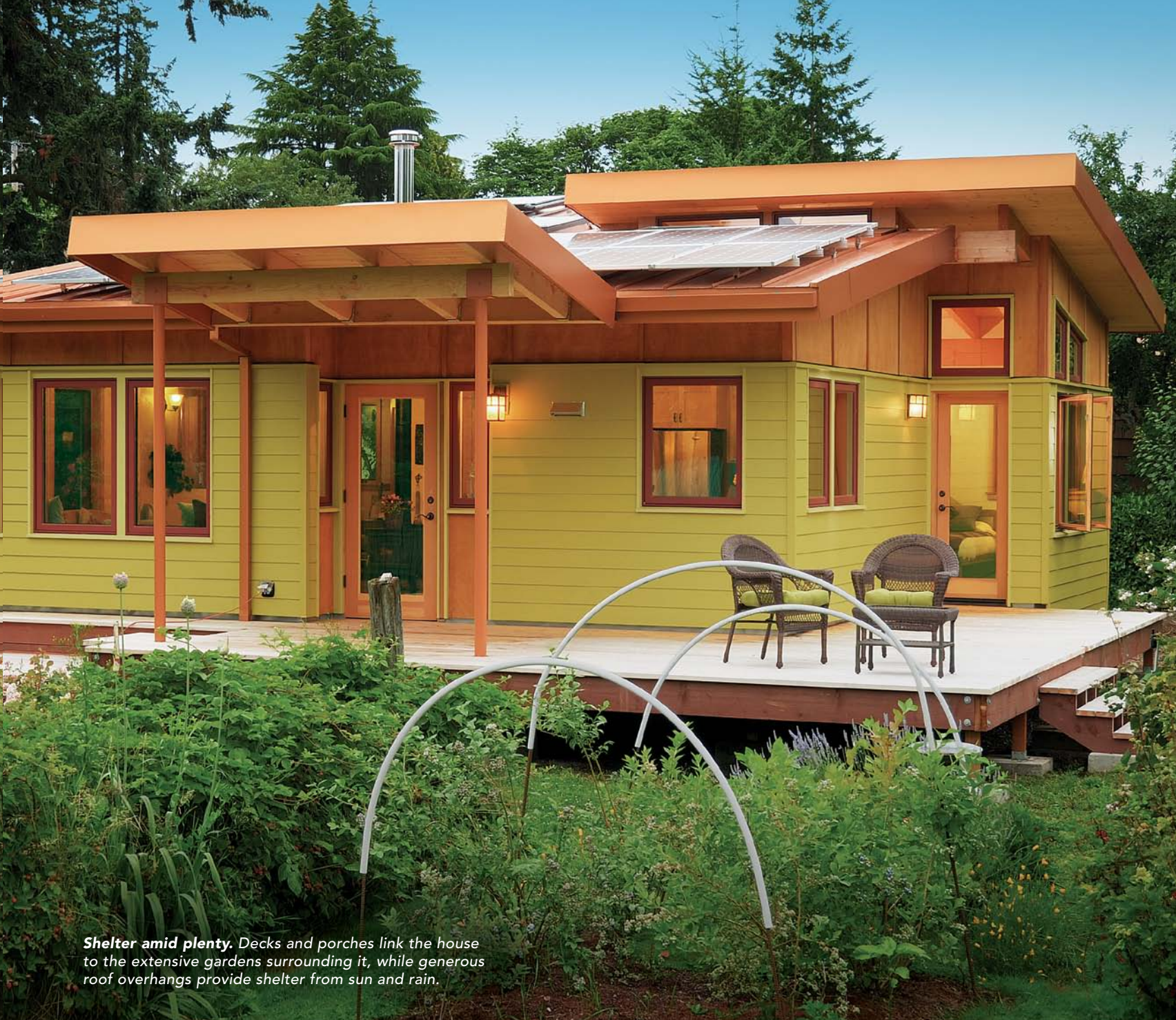
Shelter amid plenty. Decks and porches link the house to the extensive gardens surrounding it, while generous roof overhangs provide shelter from sun and rain.

sustenance minutes from Eugene's downtown. My firm's challenge was to design a compact house that would support a modest lifestyle yet foster a sense of abundance.