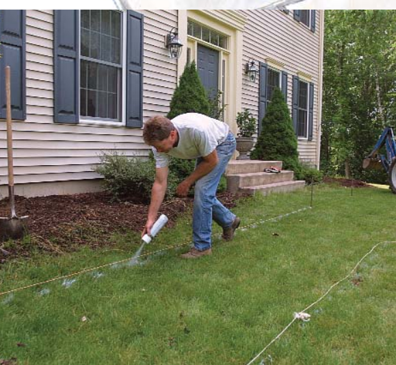
Paint offers a preview. Paint that sprays upside down marks the perimeter of the proposed walk and gives you a chance to see how it will look with the landscape and house.

The walk's path should be direct and connect the most commonly used entries to the street, driveway, or parking area.