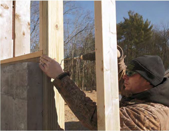
Tack them in place. Screw the taller walls to the mudsill and to the shorter walls. Use pressure-treated studs where they'll contact masonry, and use Sill Seal at this interface.