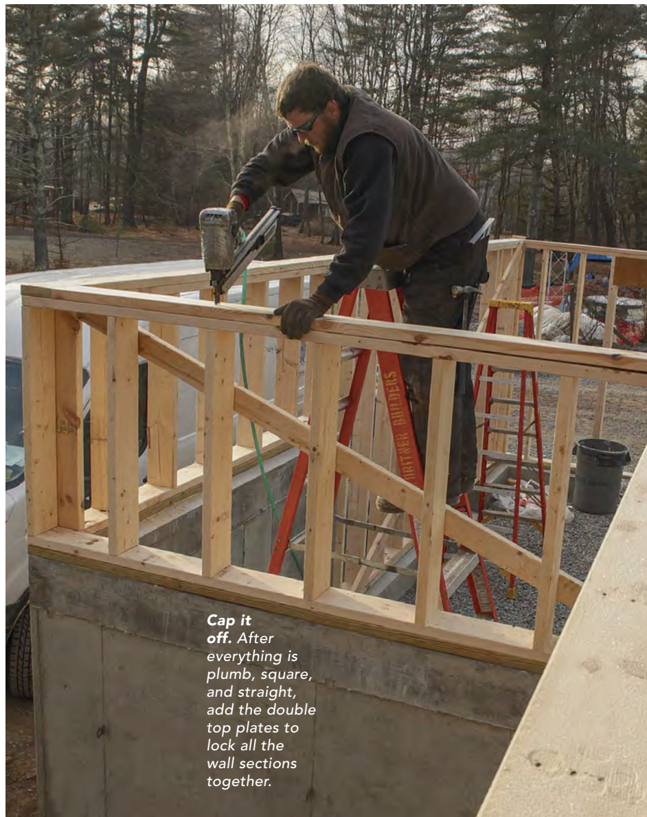
Cap it off. After everything is plumb, square, and straight, add the double top plates to lock all the wall sections together.