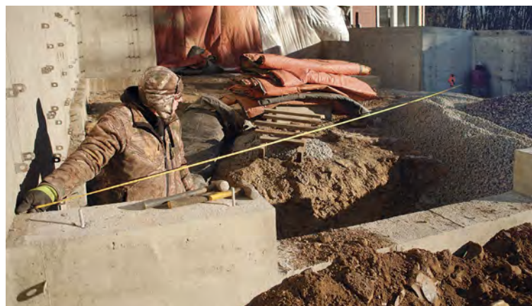
Check for square. Use a long tape to measure diagonally both directions across the foundation's rectangles to check for square. The diagonal measurements for each major section need to be within \frac{3}{4} in.