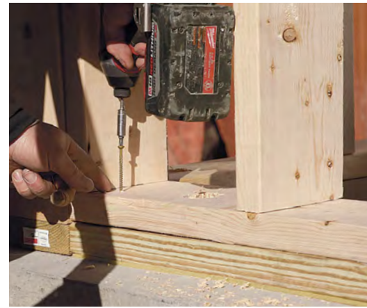
Tip 'em up. After lifting the cripple walls, tack them to the mudsill and to each other with 3-in. construction screws.