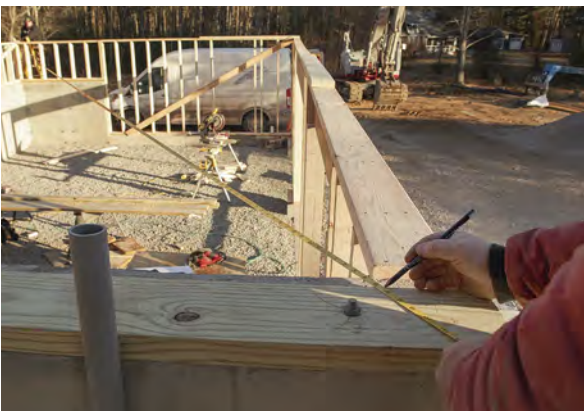
Check for square. Once everything is built up to the same plane and the corners are plumb, pull diagonals to check for square.