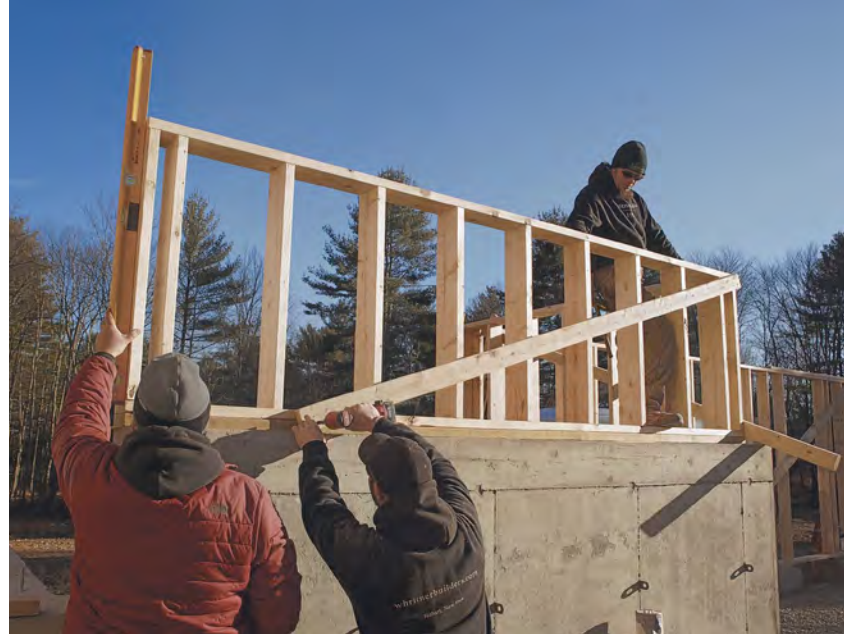
Plumb and brace. Use a plate level and muscle to plumb the wall sections and corners, and cross-brace with 2x material screwed to the inside of the walls so it doesn't interfere with sheathing.