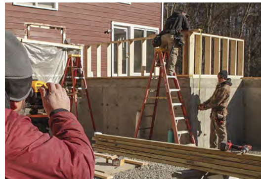
Check your work. Tack a scrap of 2x on top of the cripple wall to represent the double top plate, then pull a tape down from it and sight the measurement with the builder's level. Then pull a measurement from the screw marking the joists on the story pole. The two measurements should match.

the cripple walls. I deduct 4½ in. for the bottom plate and double top plates, and another 1⅝ in. for the mudsill. Whatever's left is the stud height.